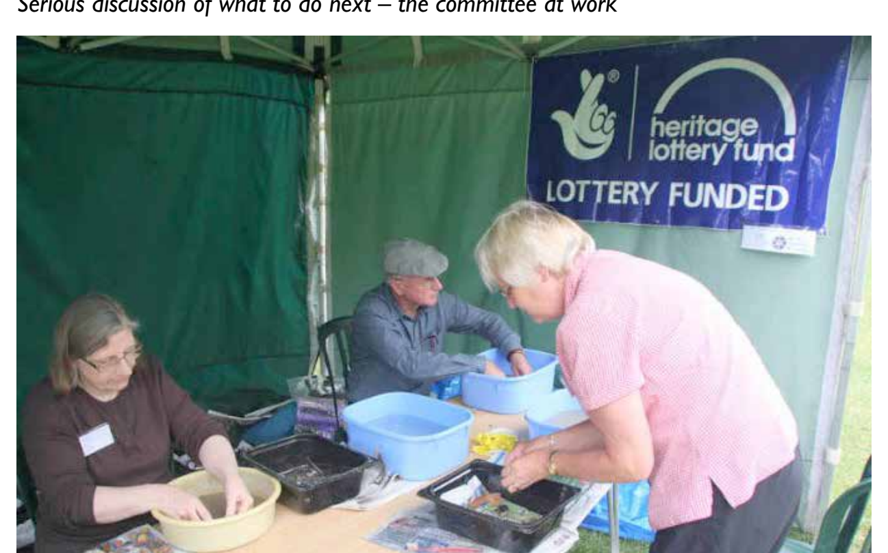
Helpers washing the test pit finds in the tent at Wimpole