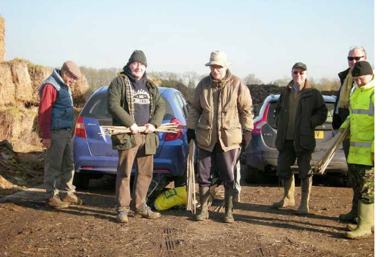
The group ready for action - Cambridge Road Farm