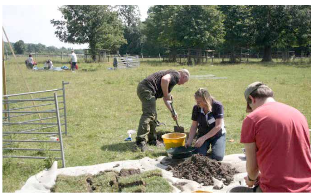
You in your small hole and me in mine – volunteers helping out at the Wimpole test pits