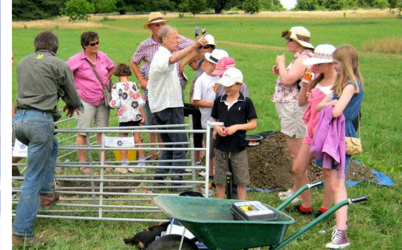
The ice creams are over there! Visitors to the test pitting at Wimpole during the hot