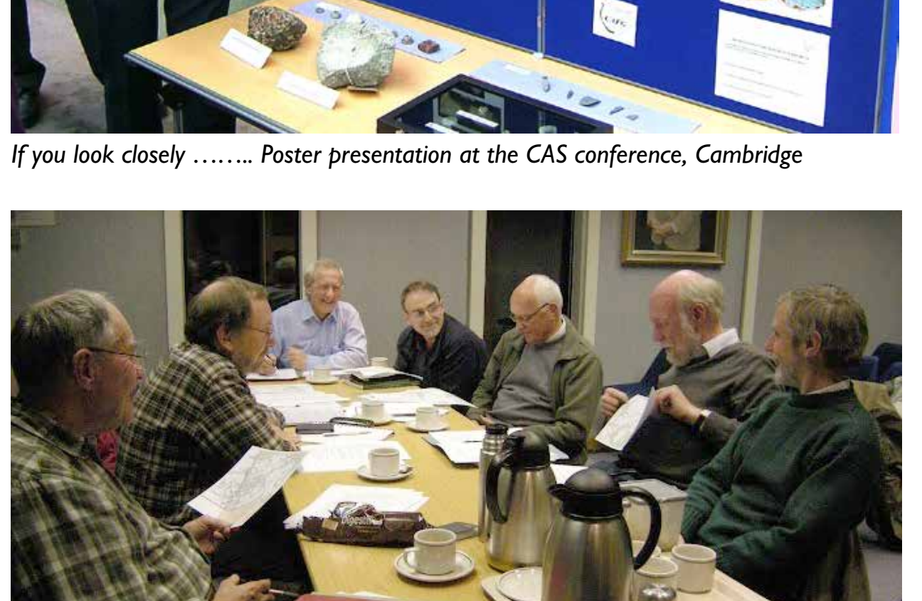
Serious discussion of what to do next – the committee at work