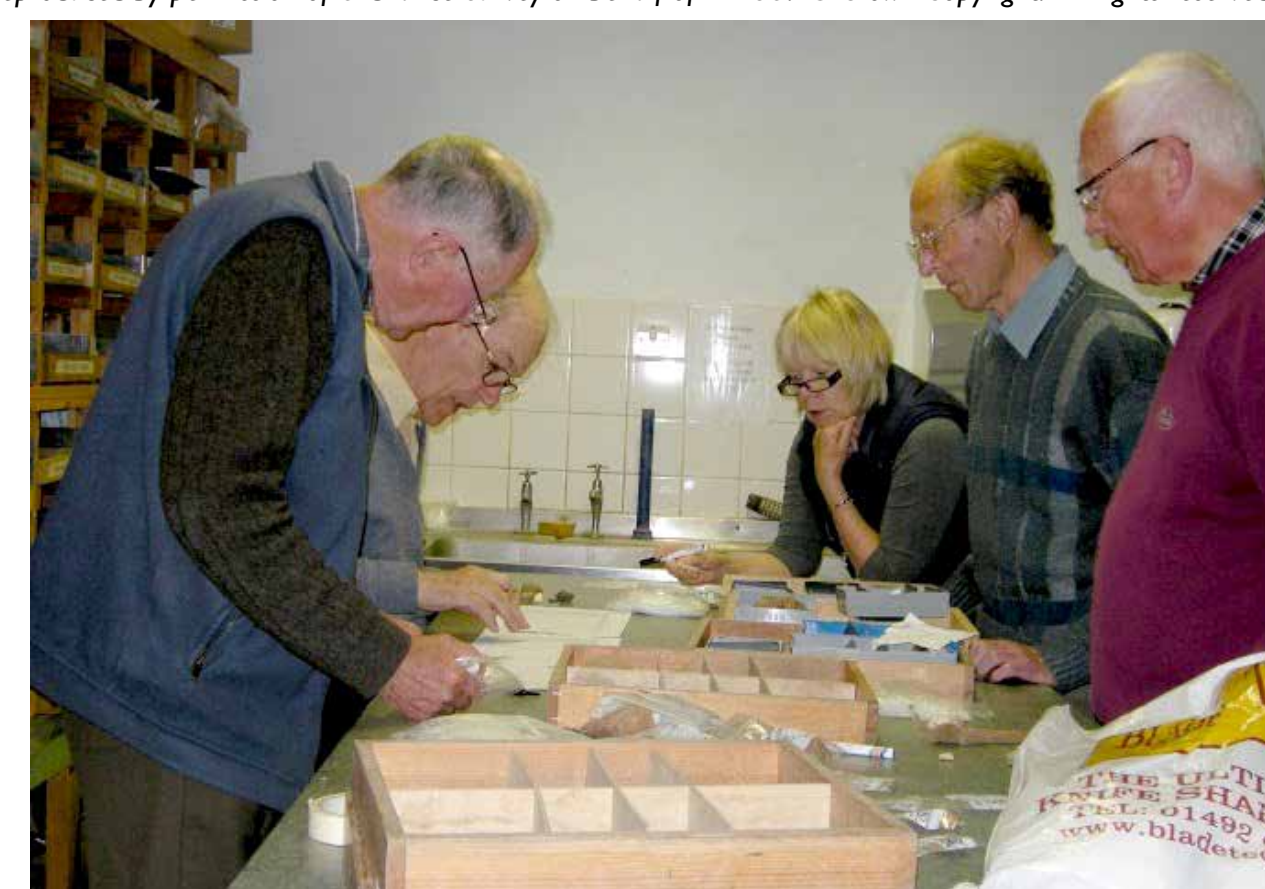
How many pieces? – sorting out the finds